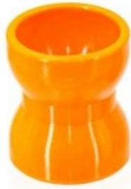
3/4 Double Socket