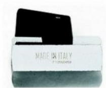
3/8 Female Valve