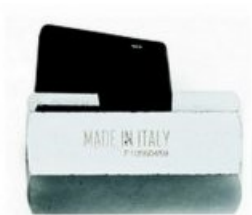
1/2 Female Valve