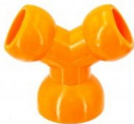
1/2 Y Fitting