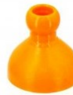
1/2 to 1/4 Adapter