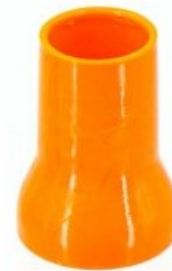
Round Nozzle ID 19 mm