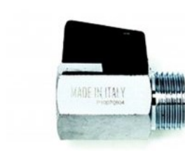
3/8 Male - Female Valve