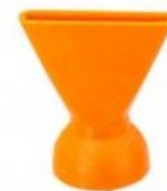
Flare Nozzle 25X2 mm