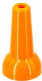
Round Nozzle ID 5 mm