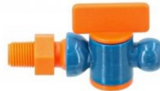
1/8 Male NPT Valve