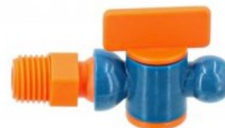
1/4 Male NPT Valve