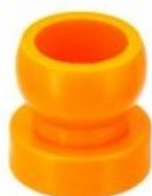
1/2 Fixed Mount ID 10,5 mm