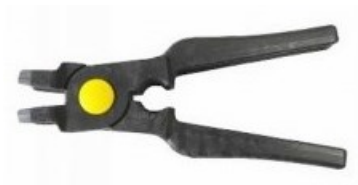
Assembly Plier 3/4