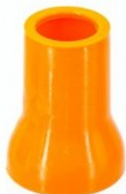
Round Nozzle ID 16 mm