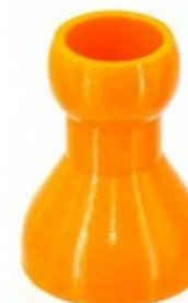
3/4 to 1/2 Adapter