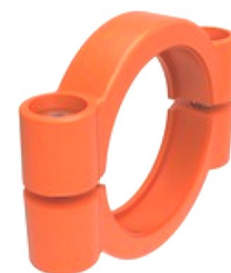
Element Clamp 3/4 System