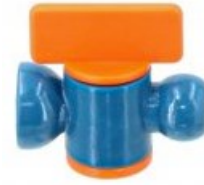
In-Line Valve 1/4