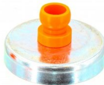
Magnetic Fixed Mount 1/2