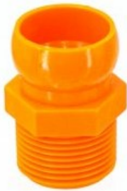
3/4 NPT Connector