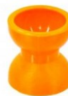
1/2 Double Socket