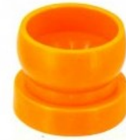
3/4 Fixed Mount M8 Threaded