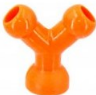
1/4 Y Fitting