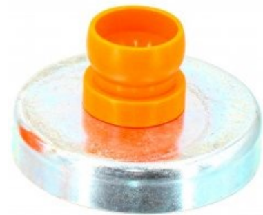
Magnetic Fixed Mount 3/4