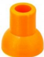
Round Nozzle ID 11 mm