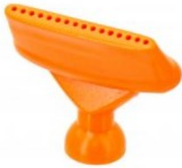
Flare Nozzle 16 Hole ID 1,5 mm