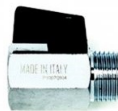
1/2 Male - Female Valve