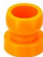
1/2 Fixed Mount M8 Threaded