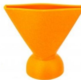
Flare Nozzle 50 X 2 mm